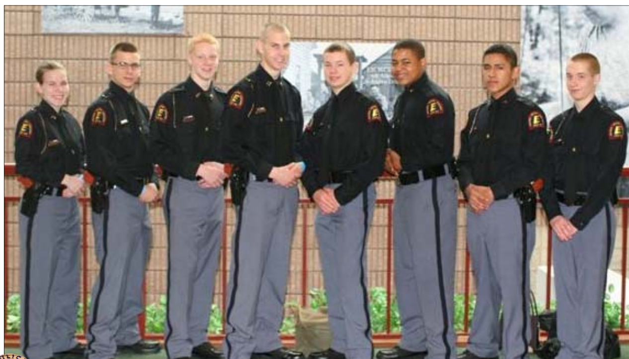
The RPD Explorers line up for a group photo at Winterfest.